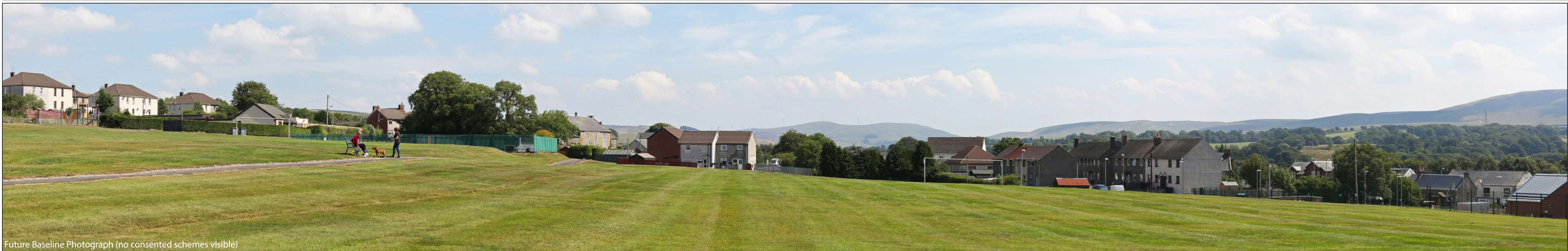
Future Baseline Photograph (no consented schemes visible)