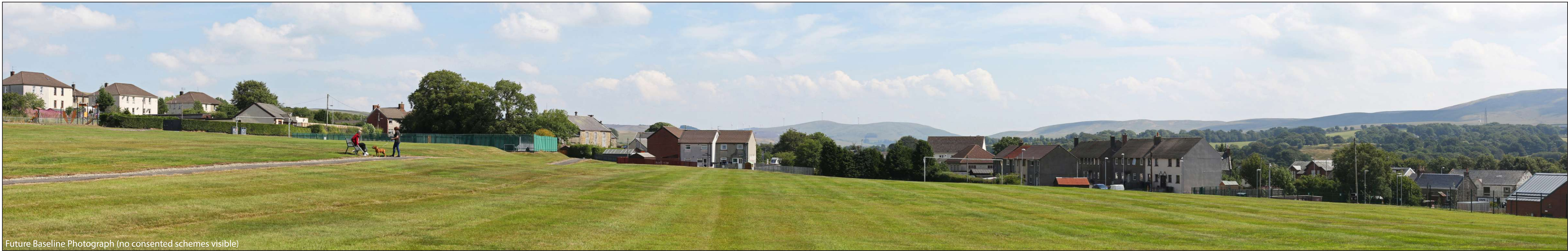
Future Baseline Photograph (no consented schemes visible)